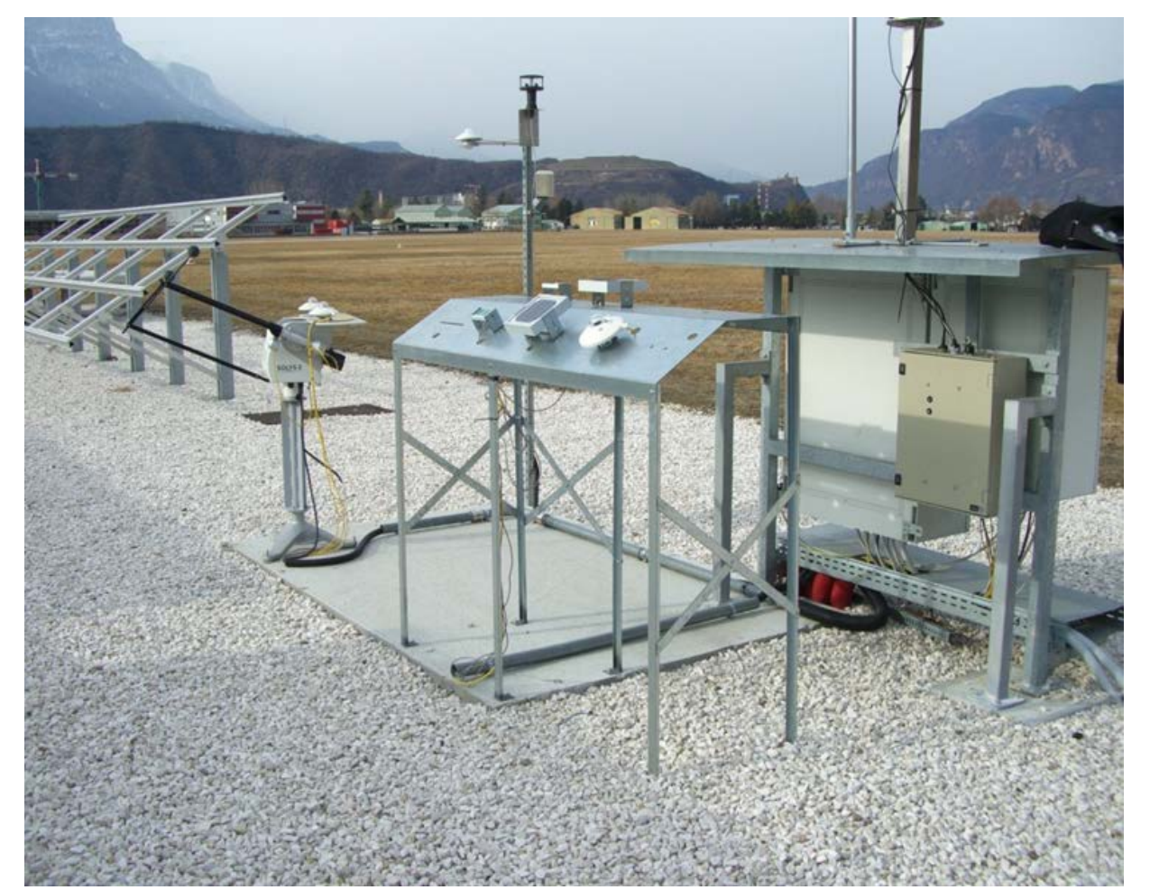
Fig. 1. Meteo station